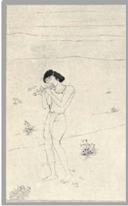
MY SONG HAS PUT OFF HER ADORNMENTS