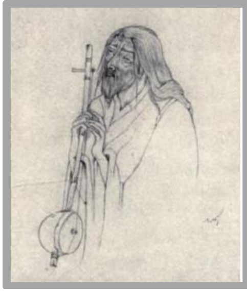
THE SONG I CAME TO SING Drawn by Nandalal Bose