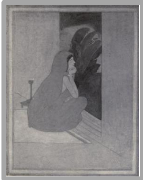
ART THOU ABROAD ON THIS STORMY NIGHT? Painted by Nandalal Bose

From the traveller, whose sack of provisions is empty before the voyage is ended, whose garment is torn and dust-laden, whose strength is exhausted, remove shame and poverty, and renew his life like a flower under the cover of thy kindly night.