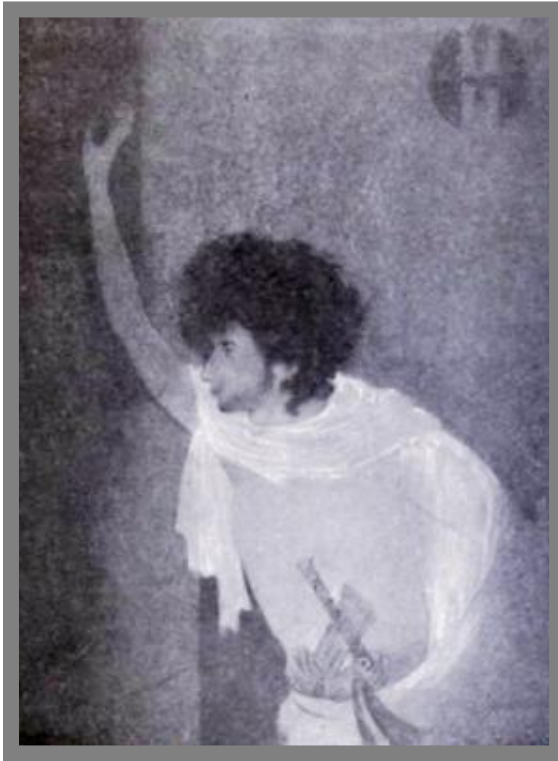
HAVE YOU NOT HEARD HIS SILENT STEPS? Painted by Abanindranath Tagore

In sorrow after sorrow it is his steps that press upon my heart, and it is the golden touch of his feet that makes my joy to shine.