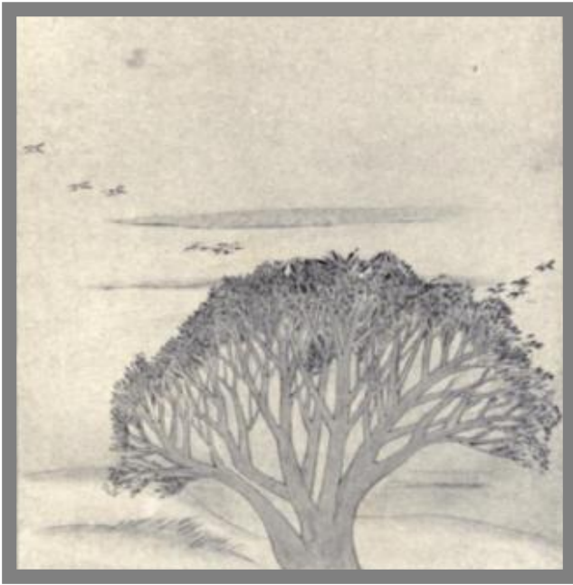
THOU ART THE SKY AND THOU ART THE NEST AS WELL Painted by Nandalal Bose

But there, where spreads the infinite sky for the soul to take her flight in, reigns the stainless white radiance. There is no day nor night, nor form nor colour, and never, never a word.