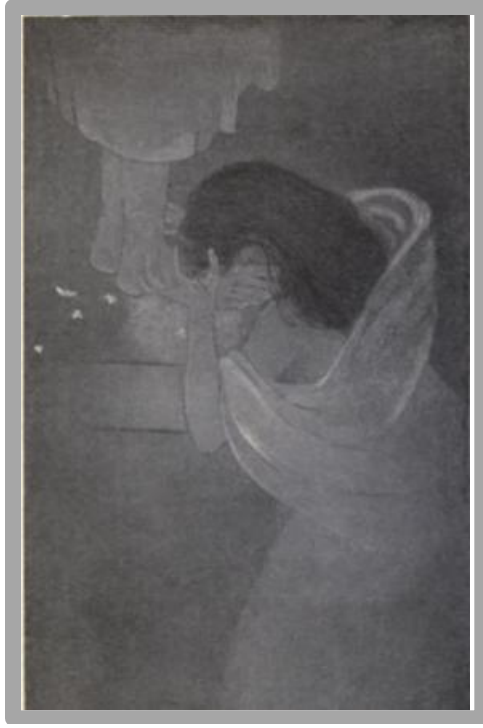
HERE IS THY FOOTSTOOL Painted by Surendranath Kar