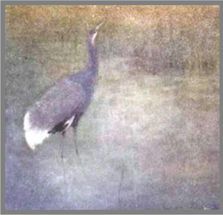
THE RAIN HAS HELD BACK FOR DAYS Painted by Abanindranath Tagore