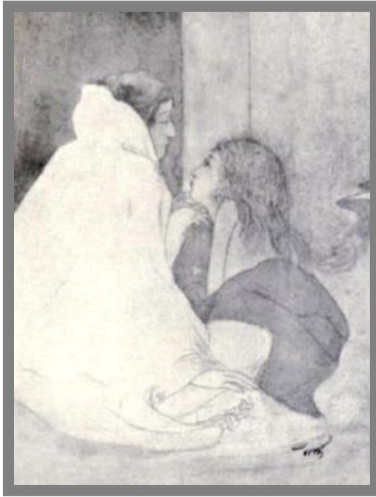
WHEN I BRING TO YOU COLOURED TOYS