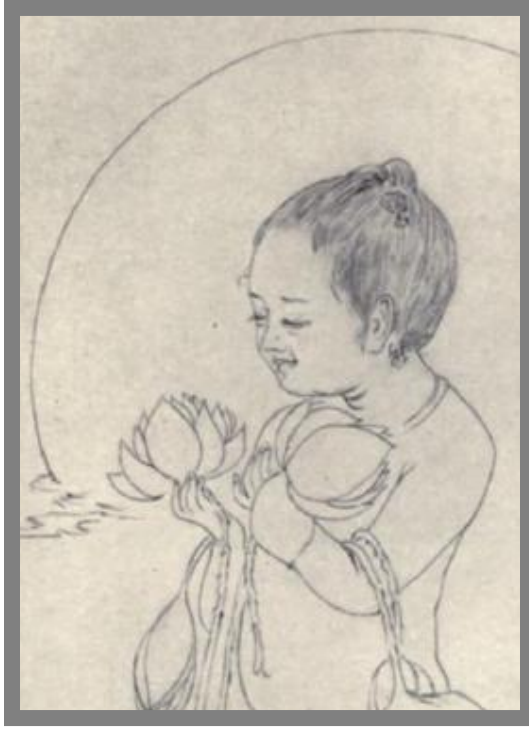
WHEN I GO FROM HENCE LET THIS BE MY PARTING WORD Drawn by Asit Kumar Haldar