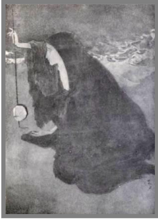
EVER IN MY LIFE HAVE I SOUGHT THEE WITH MY SONGS Painted by Abanindranath Tagore